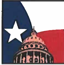
TFDA Services, Inc.