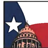
TFDA Services, Inc.